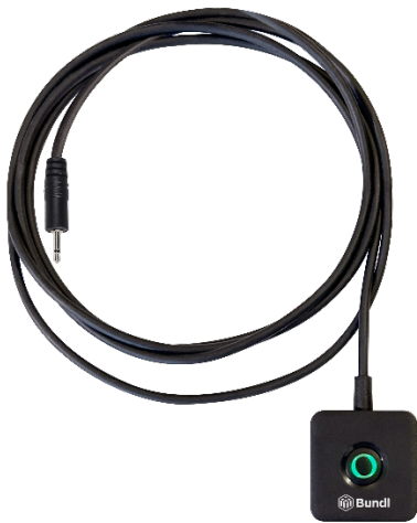
Q.1 Remote Wired Input Switch