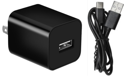
Q.1 USB-A to USB-C power cable with power adapter block